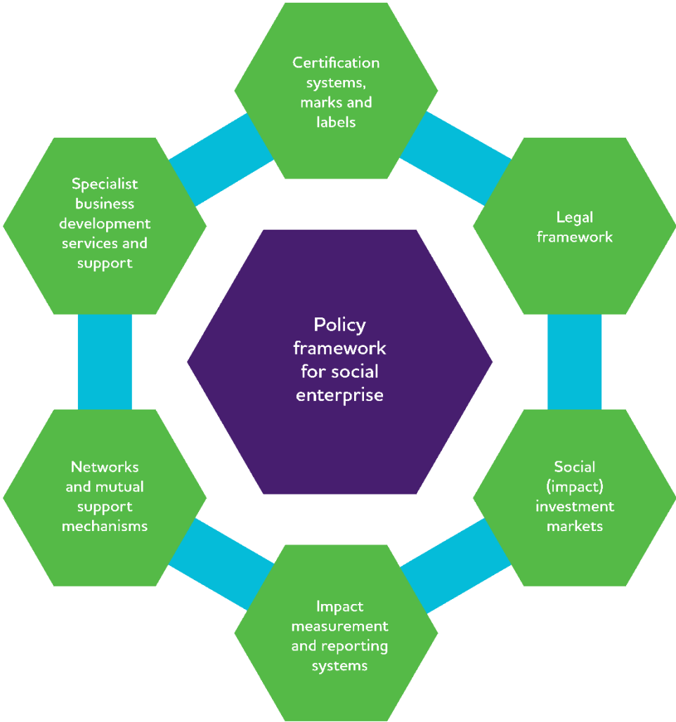
Figure 2: The six dimensions of a social enterprise ecosystem